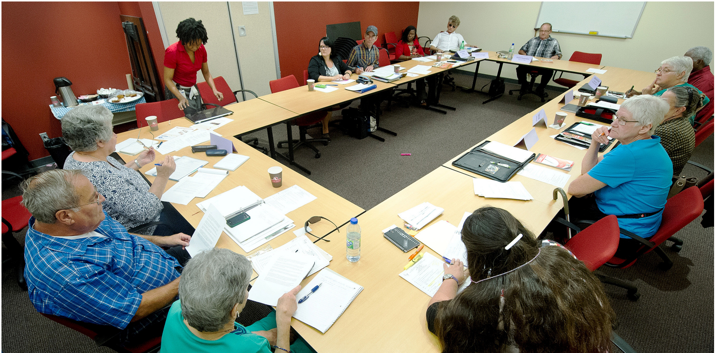
CCR members giving their overview serious thought in the fall of 2014.