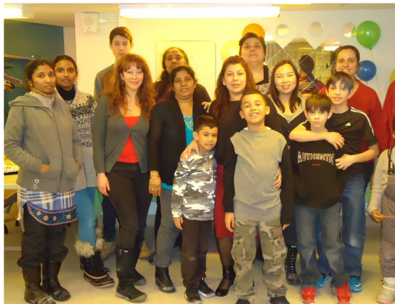
The Neighbours from Five Continents held their first activity at the end of February.