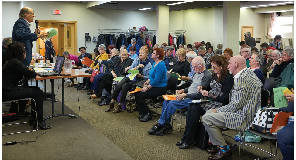
The 2016 elections had a record number of delegates turn out at Centre Saint-Pierre.