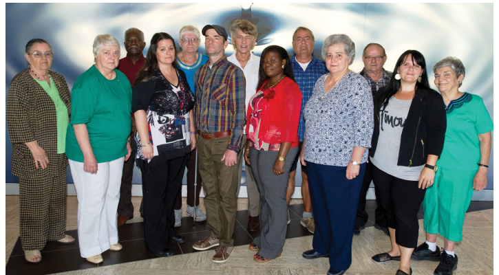
The members of the Advisory Committee of Tenants (CCR), elected in December 2013, presented their first report to the Annual General Assembly on October 23, 2014.

At the end of the day, several representatives thanked the CCR for its conscientious work and the wealth of content of the assembly: more informative than ever.