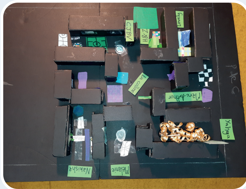
Model made by children aged 5 to 12

https://fr.surveymonkey.com/r/Boyce-viau