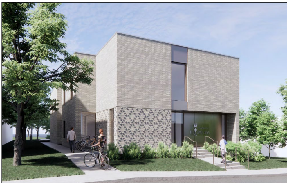
Sketch of the front facing rue Lavoie