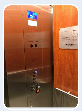
Example after the work