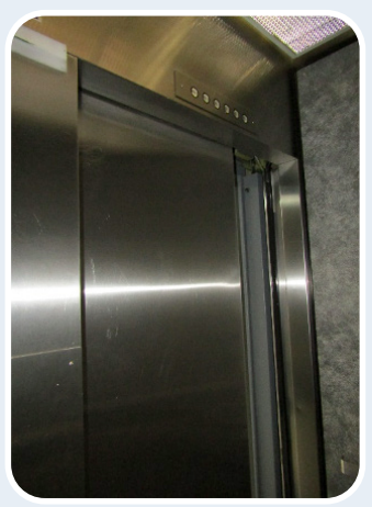
Before the work

The emergency phone, in case the elevator breaks down, will still be connected to the OMHM call centre.