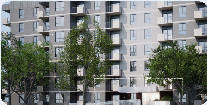
The future façade