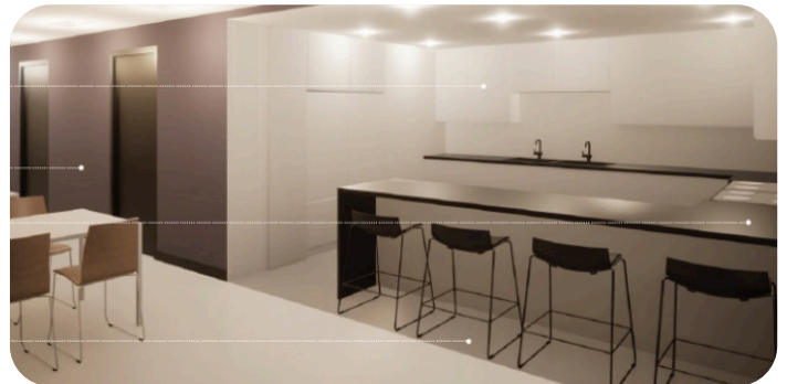
The common room