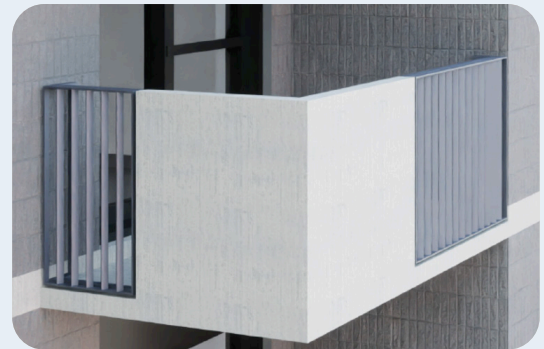
The future balcony

The intercom will be installed outside for improved security