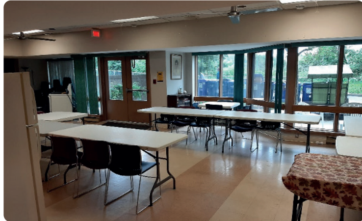
Basement common area with exit to the outside