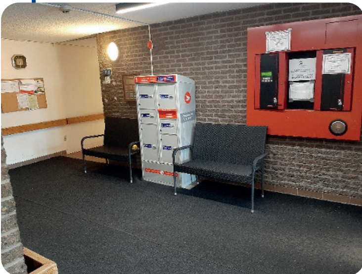
Current main entrance layout