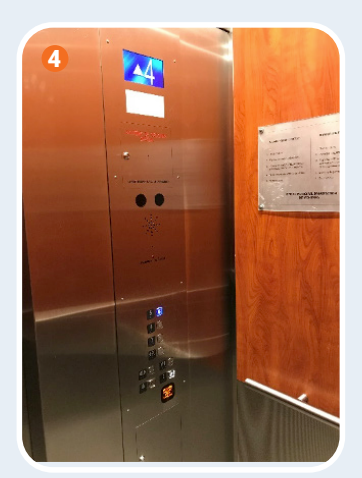
Example after the work